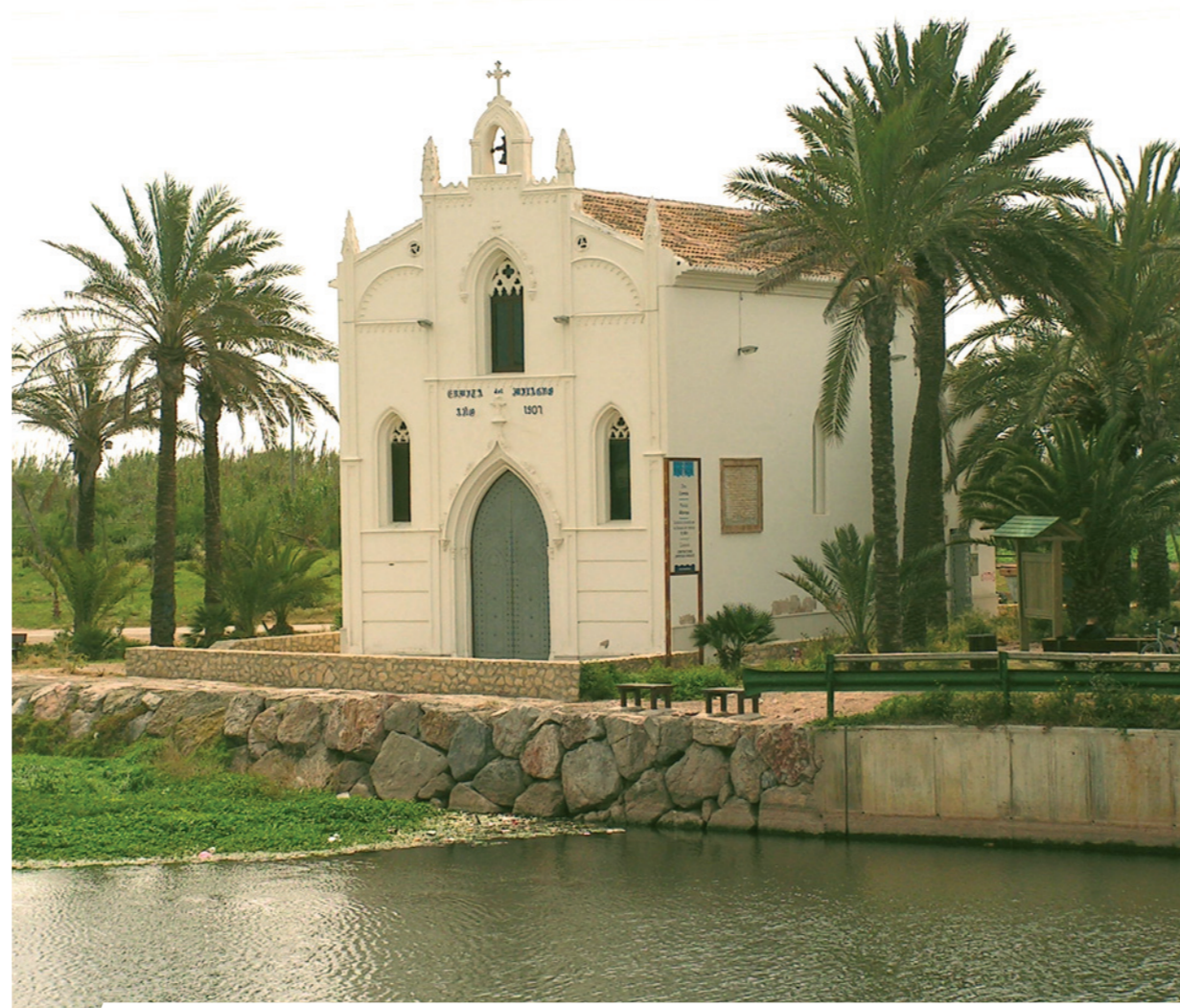
Hermitage Church in Alboraya