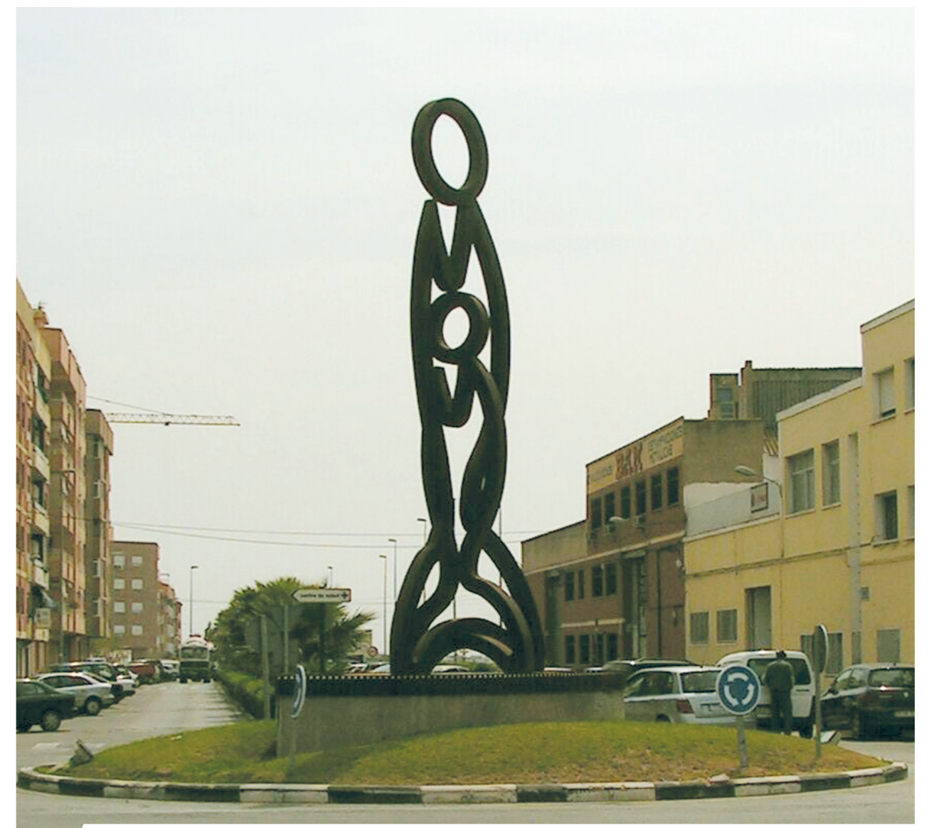
Commemorative sculpture of the miracle in the city-center